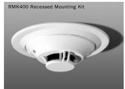
RMK400 Recessed Mounting Kit

System Sensor mounting bases and kits provide a variety of ways to install detectors in any application. 200 Series detectors can be mounted in either flanged or flangeless bases depending on junction box selection (see junction box selection guide).